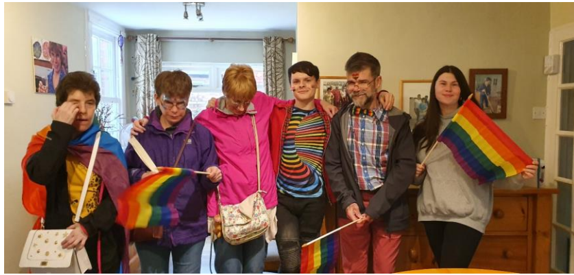
I took part in some of the Kaleidoscope events celebrating diversity.